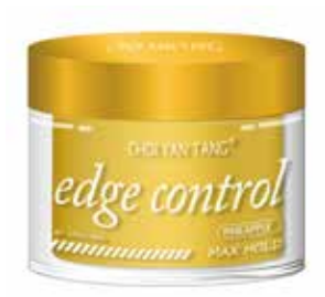
Edge Control Gel Pineapple Volume: 75g/100g