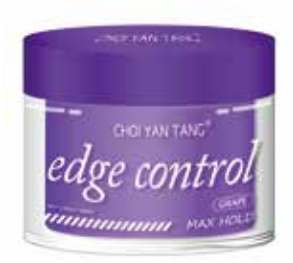
Edge Control Gel Grape Volume: 75g/100g