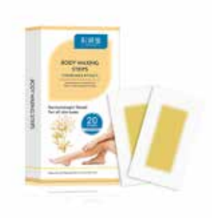
Body Wax Strips Chamomile Volume: 20 Strips