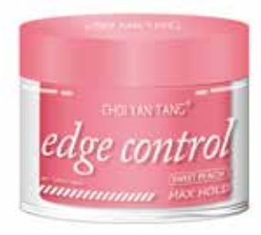
Edge Control Gel Sweet Peach Volume: 75g/100g