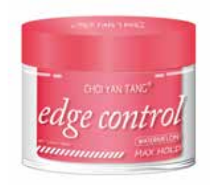
Edge Control Gel Watermelon Volume: 75g/100g