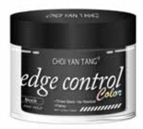
Color Edge Control Gel Black Volume: 75g/100g