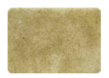
Acid Amino Shampoo Bar For Damaged Hair &Anti-dandruff Volume: 80g