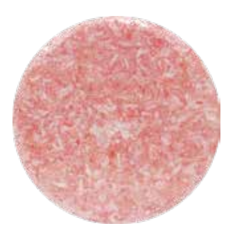
Herbal Nourish Shampoo Bar Safty & Ultra Moisture Volume: 60g