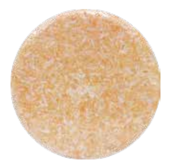
Herbal Nourish Shampoo Bar Safty & Ultra Moisture Volume: 60g