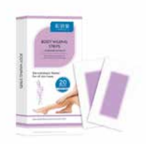
Body Wax Strips Lavender Volume: 20 Strips