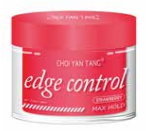
Edge Control Gel Strawberry Volume: 75g/100g

No residue, No white, No flakes and Natural strongly holding Hair Edge Control Wax