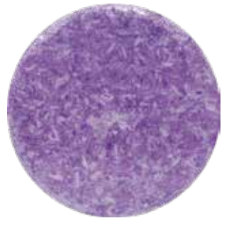
Nourish shampoo Bar Safty & Ultra Moisture Volume: 60g

Herbal Nourish Shampoo Bar Safty & Ultra Moisture Volume: 60g