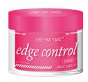
Edge Control Gel Cherry Volume: 75g/100g