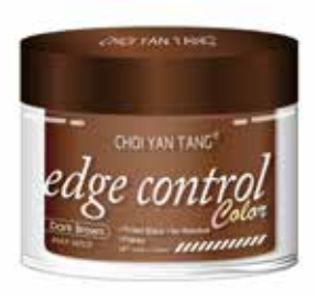
Color Edge Control Gel Dark Brown Volume: 75g/100g