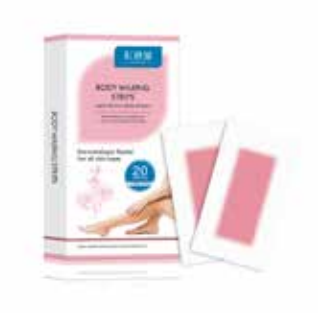
Body Wax Strips Rose Volume: 20 Strips